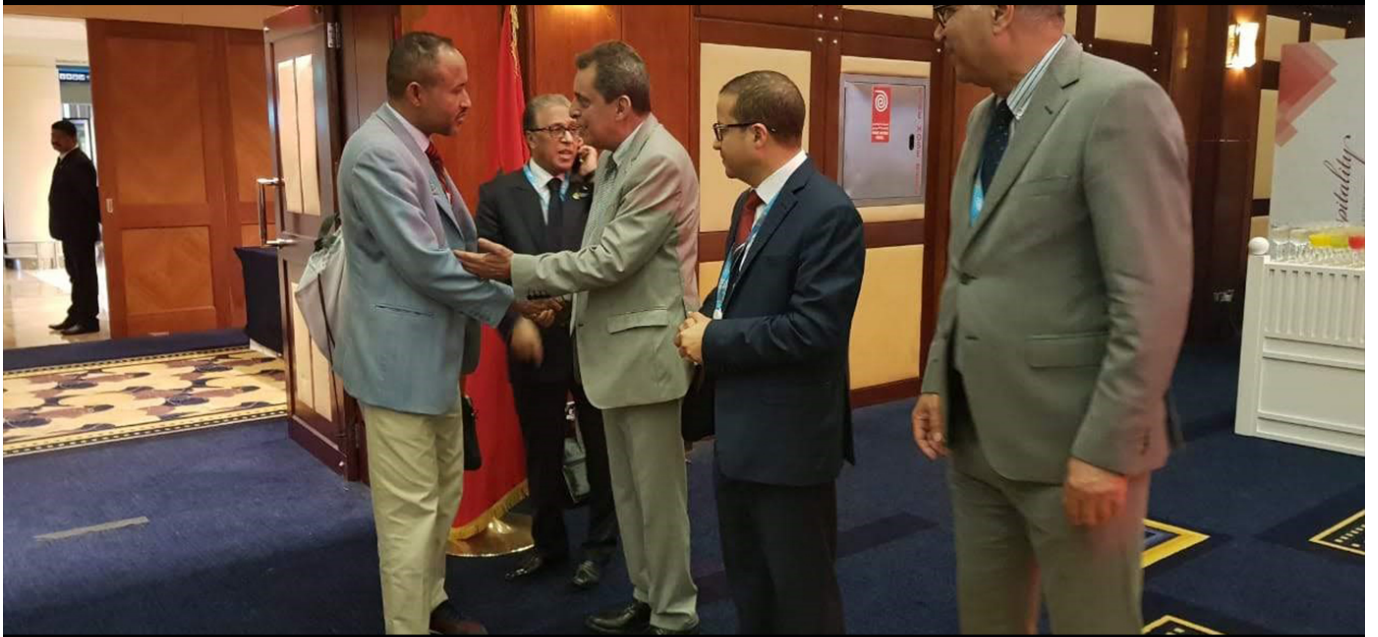
Representative of Mauritania