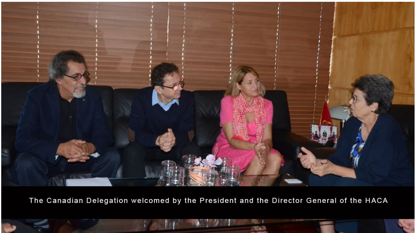
The Canadian Delegation welcomed by the President and the Director General of the HACA