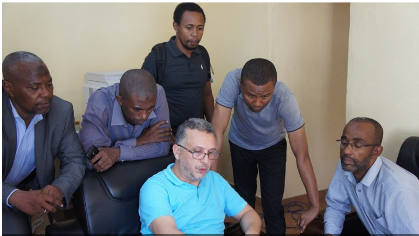
Remote demonstration on HACA's reporting tools