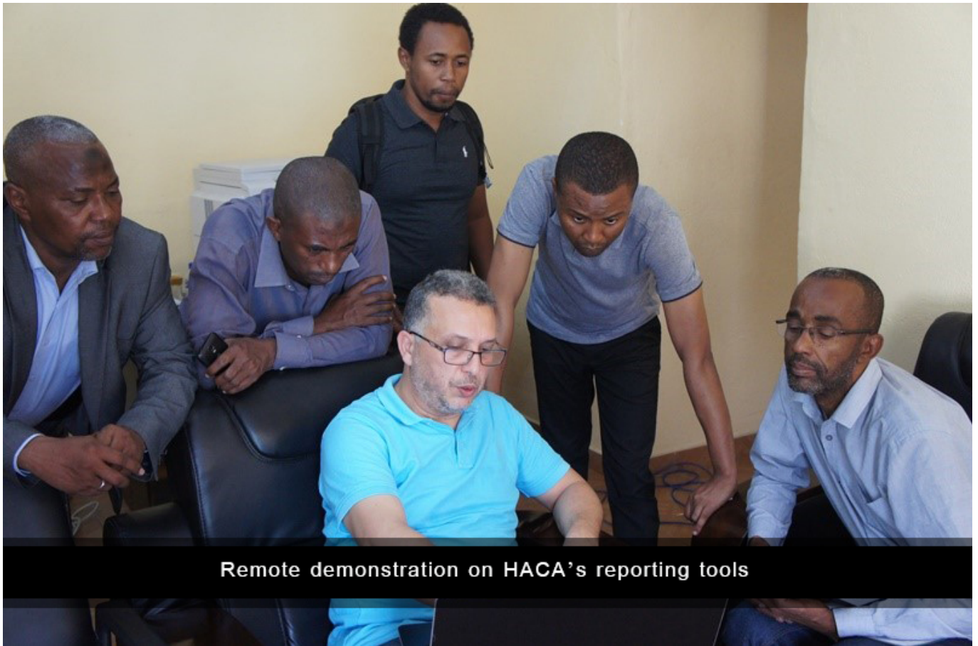
Remote demonstration on HACA's reporting tools