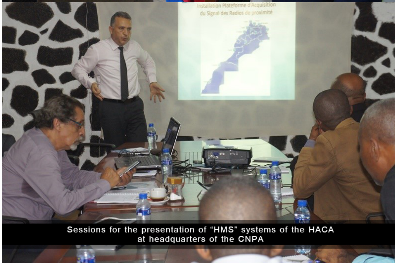
Sessions for the presentation of "HMS" systems of the HACA at headquarters of the CNPA