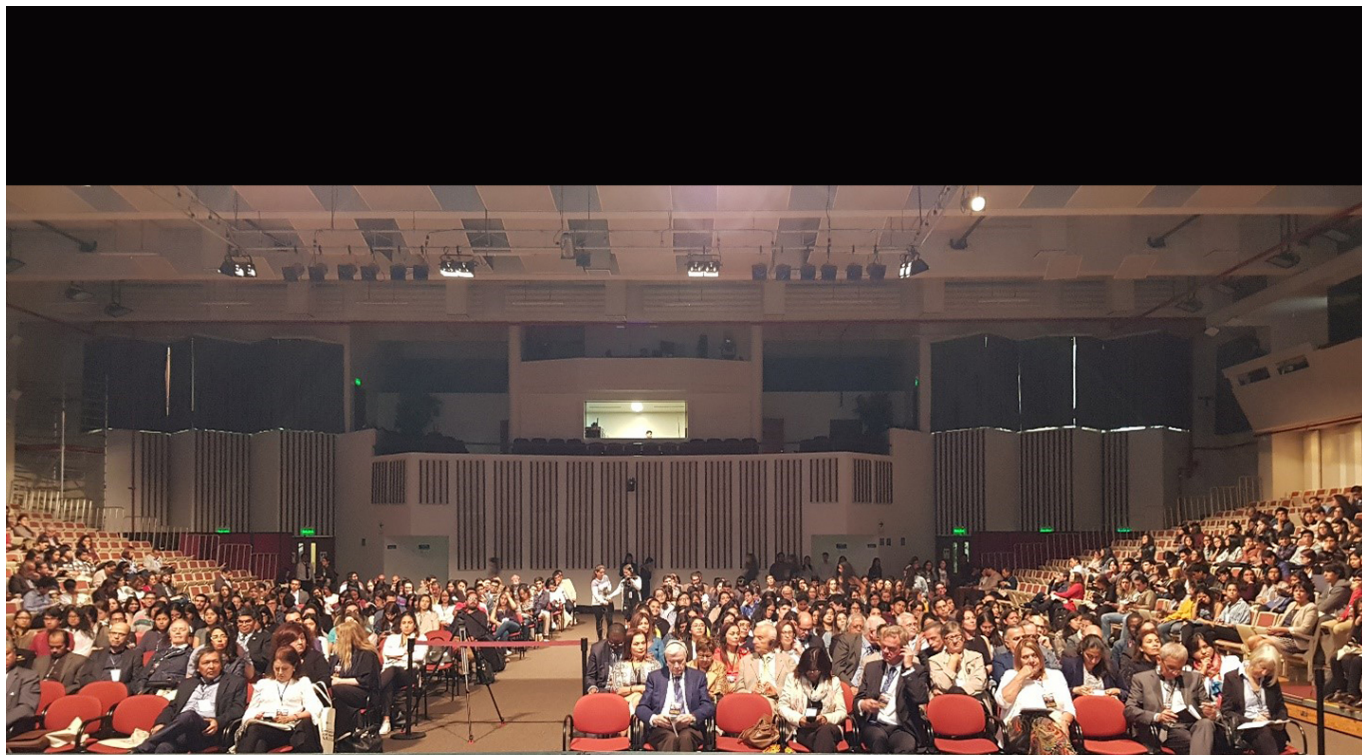
A thousand participant attending the three days conference and thematic workshops.