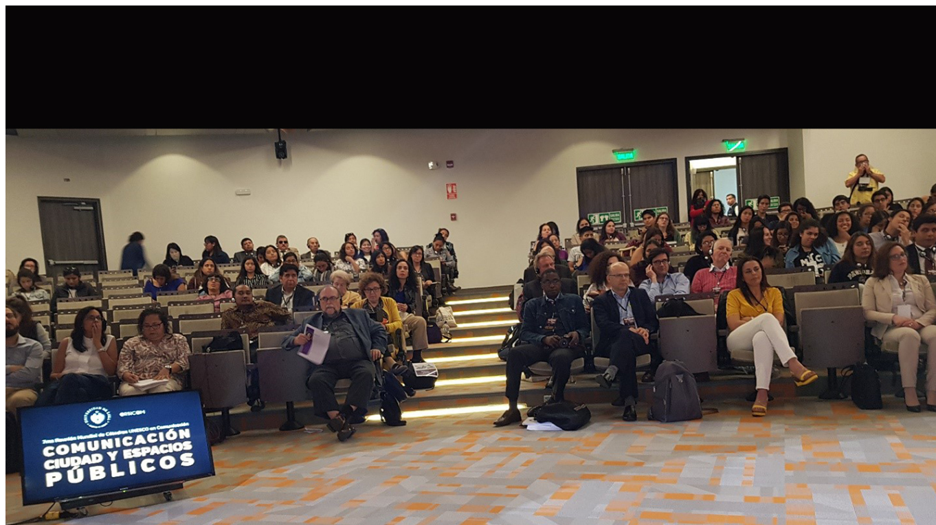
A work agenda between Orbicom and Unesco on « freedom of speech at the digital era ».